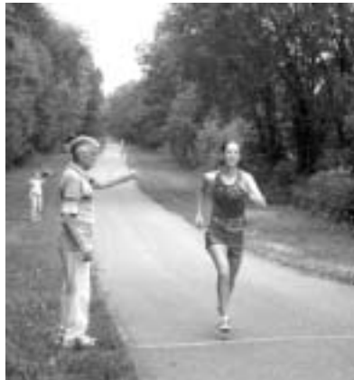
need a caption (winner of female?)